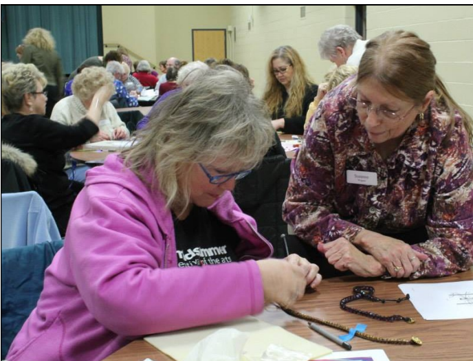
At the November meeting, members learned to make one of the popular leather-wrapped bracelets. Eager members selected their kit colors, and then set to work.