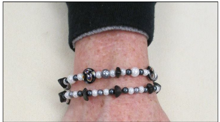
During 2013, the Community Service Committee has introduced veterans at the Milwaukee VA Center to beading. Here, one veteran proudly displays her new bracelet.